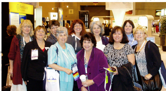
SCSGNA Board Members together at the Exhibit Hall.