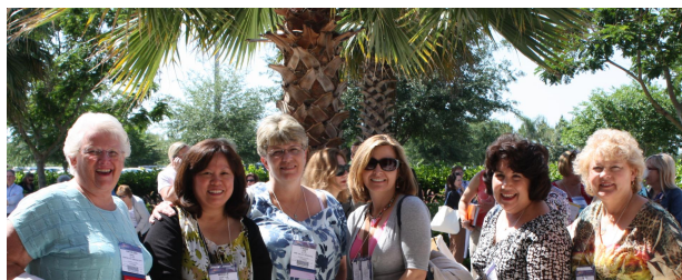
(Above) Members enjoying the "fire drill" in the Orlando heat.